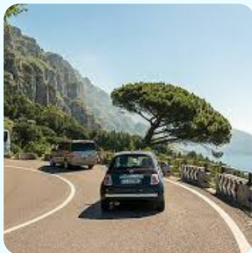
HOW TO GET AROUND